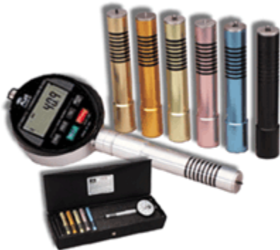
DD-3 Digital MS-1