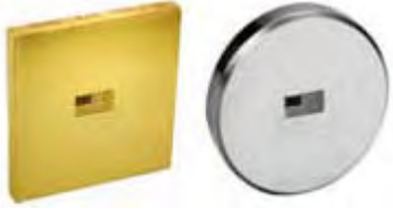
Table of Content - Rockwell Hardness Testing